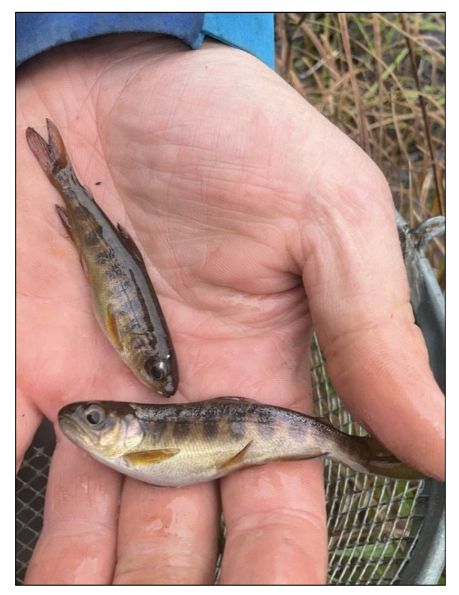
Figure 1.–Juvenile coho salmon captured at waypoint 1793.